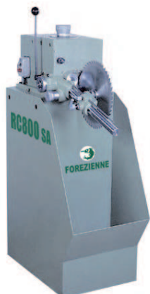
Code : MACH0311 Double et semi-automatique

SIDE-DRESSING MACHINE - FLANKEN-SCHLEIFMASCHINE RECTIFICADORA DE FLANCOS - RETTIFICATRICE DI FIANCHI