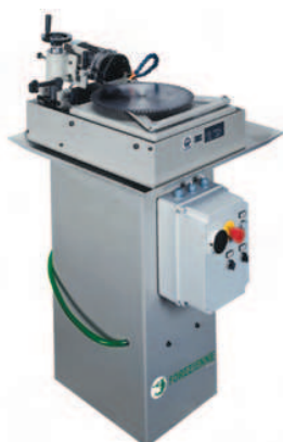
Code : MACH0111